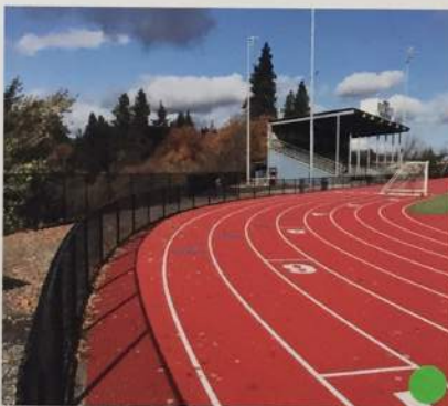
Black Vinyl-coated Chainlink