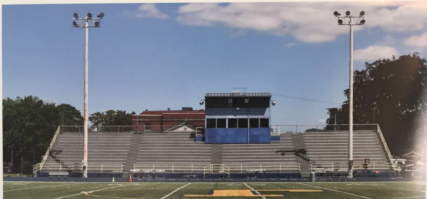
Jefferson High School