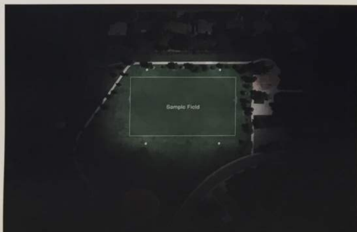
Low pole lights, poor cut-off angles