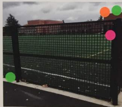
Existing Grant High Fence