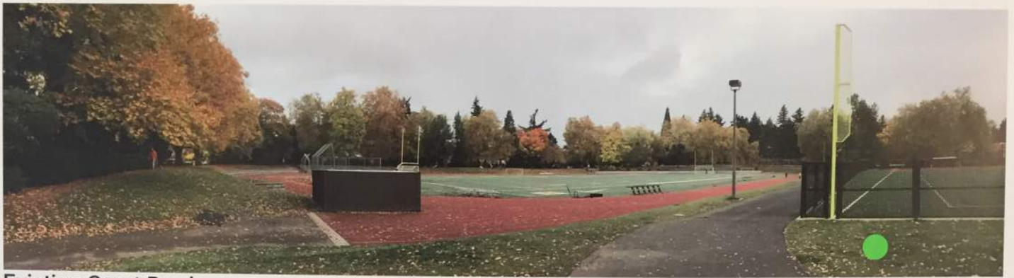
Existing Grant Bowl