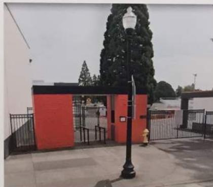
BHS Entry with Ticket Booth