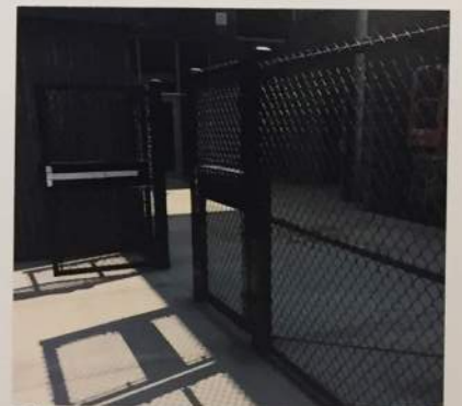
Black Vinyl-coated Chainlink