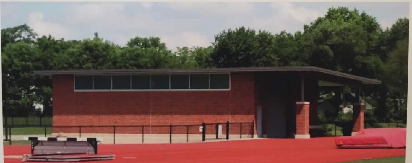
Freestanding park support buildings