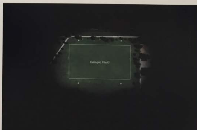
Tall pole lights, sharper cut-off angles