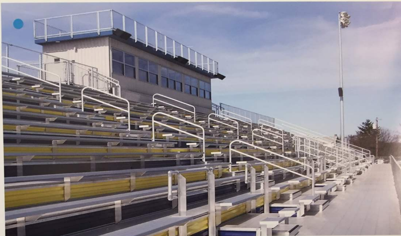
Freestanding, metal bench bleachers