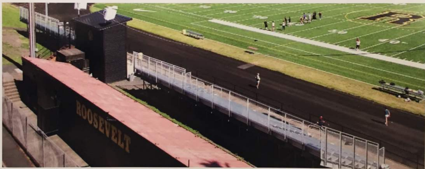
Roosevelt High School