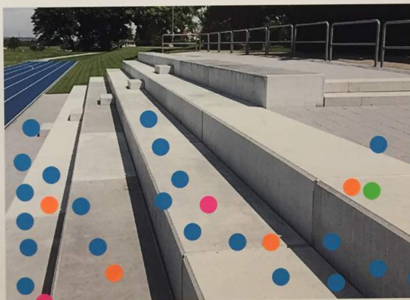
Integrated, concrete platform seating along slope